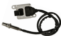
66-001P - Downstream GM (2014-10) VIO 290K+