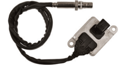
66-004P - Upstream GM (2015) VIO 180K+