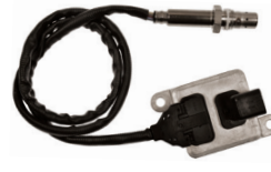
66-003P - Downstream GM (2015) VIO 180K+