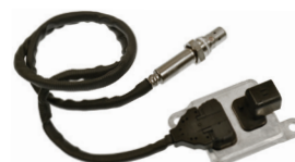
66-011P - Upstream Ram (2018-13) VIO 140K+