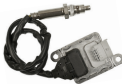
66-006P - SCR Catalyst Outlet Ram Trucks w/ 6 Cyl. 6.7L Engines (2017-14) VIO 410K+