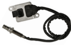
66-002P - Upstream GM (2014-10) VIO 290K+