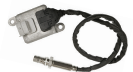
66-008P - Upstream Ram Trucks (2012-11) VIO 130K+