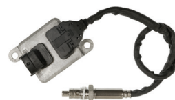
66-007P - Turbo Outlet Pipe Ram Trucks (2015-13) VIO 220K+