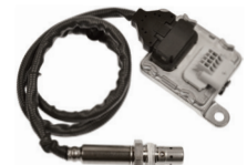
66-012P Ford (2019-17) VIO 550K+