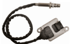
66-009P - Downstream Ram (2012-11) VIO 130K+