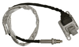
66-005P - Upstream Ram Trucks w/ 6 Cyl. 6.7L Engines (2018-13) VIO 710K+