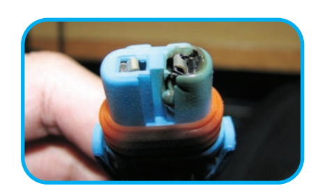
Melted Original-style Unit

Our Response: To prevent melting, Pollak's Headlight Wiring Harnesses have high-temp connectors that can withstand extreme heat. The harnesses also have 14-gauge wire for better conductivity and a "plug & play" feature that lets you plug the harness right between the factory harness and new bulb. You can even use the harness as a pigtail if the original connector is melted. Pollak's line of headlight harnesses covers the following high-temp bulbs: H1, H3, H4, H7, H9, H11, H13, 9004, 9005, 9006, 9006XS, and 9007.